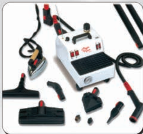
- Steam Boiler