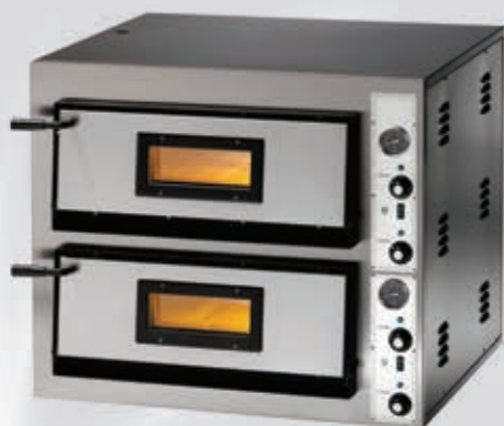
- Pizza Oven / Double Deck