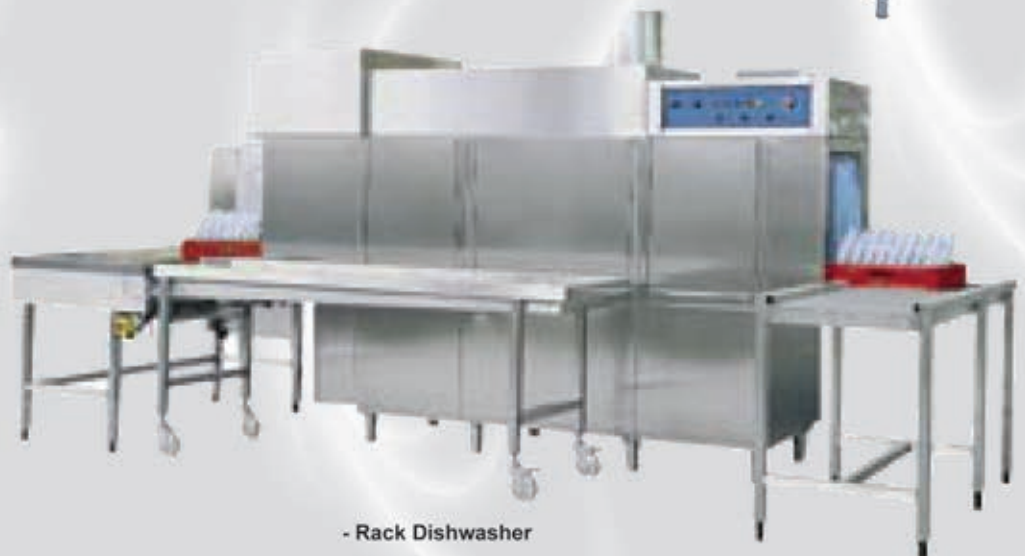
- Rack Dishwasher