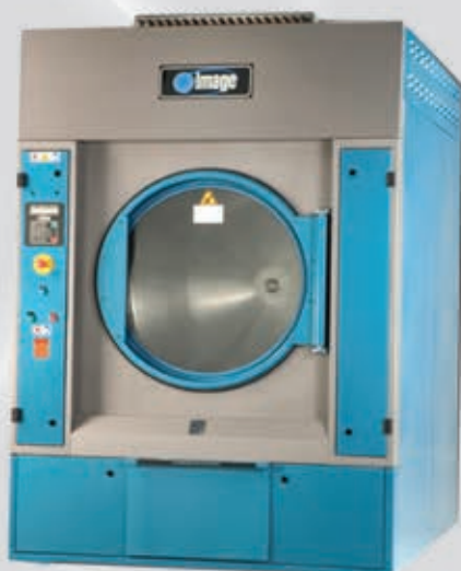
- Professional Dryer from 200 - 350 lb