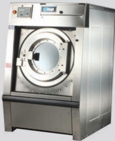
- Soft Mount washer extractor from 40 - 185 lb