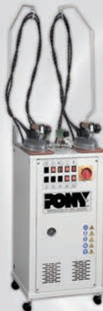
- Steam boiler