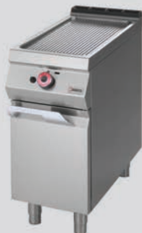
- Fry Top Ribbed & Smooth