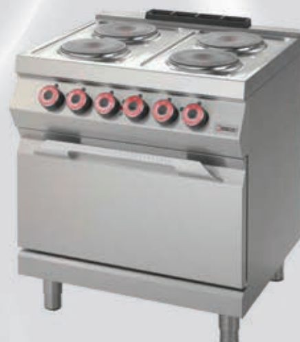
- 4 burner round plate electric cooker