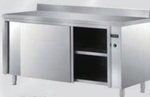
- Hot Cabinet