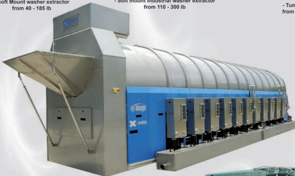
- Tunnel Washer