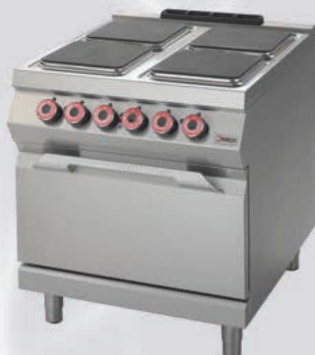
- Electric Cooker