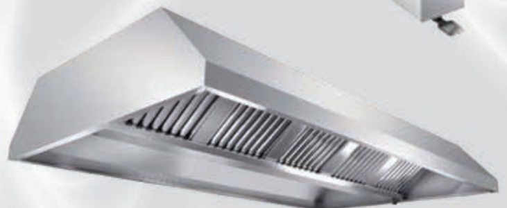
- Exhaust Hood