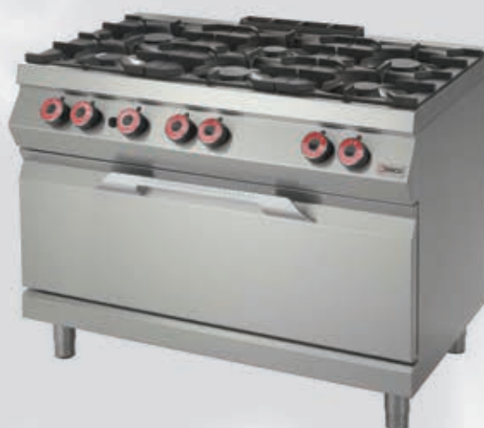
- 6 Burner Gas cooker with maxi oven