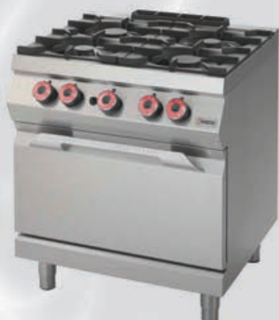
- 4 Burner Gas cooker with Oven