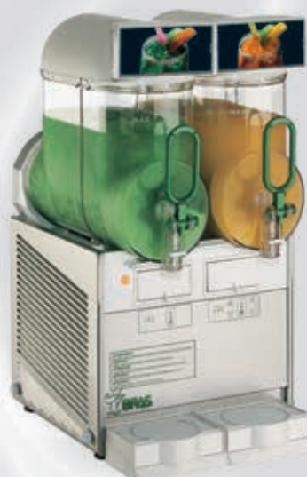
- Slush Machine