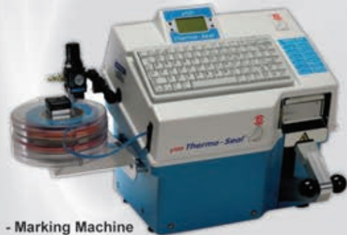
- Marking Machine