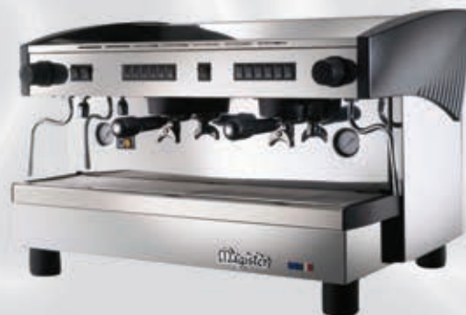
- Espresso Coffe Machines