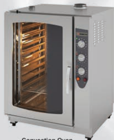
- Convection Oven