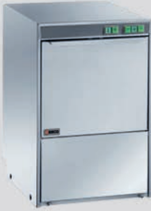
- Glass Washer & Dish Washer