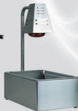
- Chips Warmer