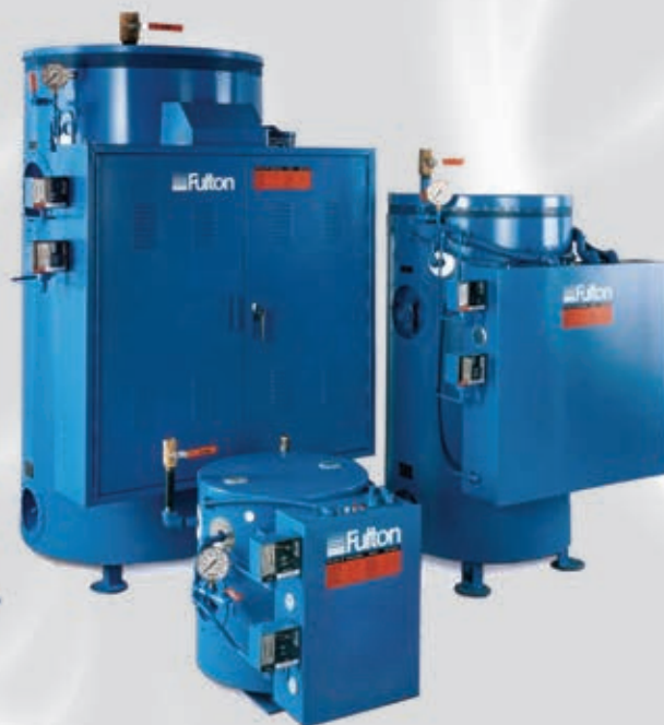
- Steam Boilers Vertical