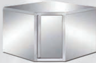
- Corner Base Cabinet & Corner Wall Cabinet