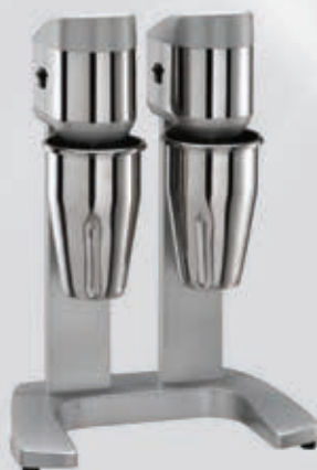
- Milk Shake