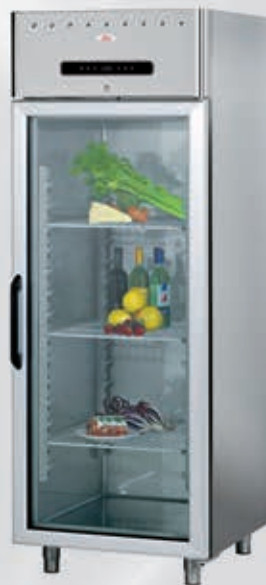
- Glass door refrigerator