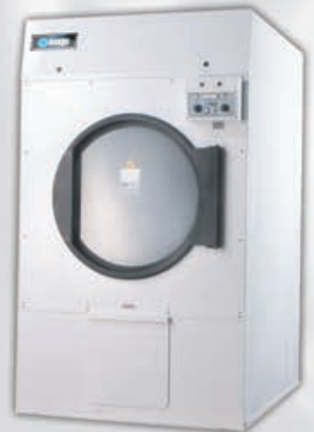
- Tumbler dryer from 30 - 170 lb