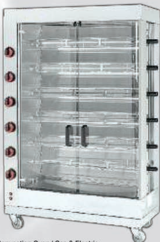
- Convection Oven / Gas & Electric