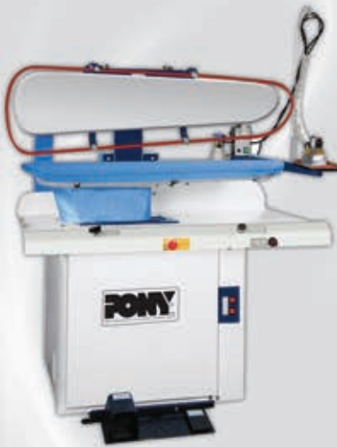
- Hot plate Press Machine