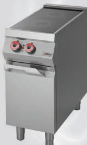
- Ceramic glass and Induction cooker