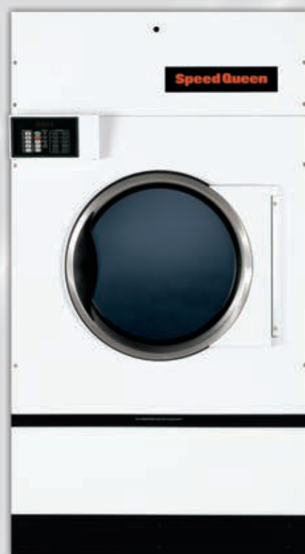
- Tumbler dryers from 25 - 200 lb