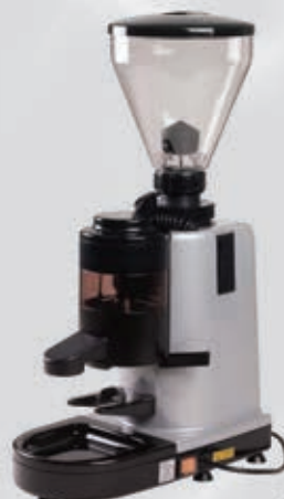
- Coffe Machines