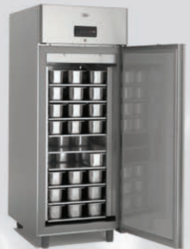
- Ice cream refrigerated cabinet