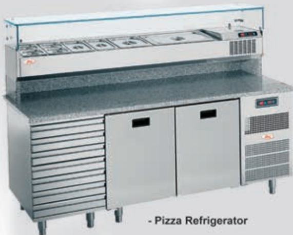
- Pizza Refrigerator