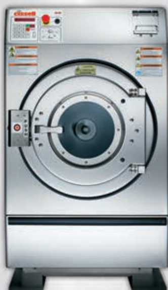
- Hard mount washer extractor from 40 - 175 lb