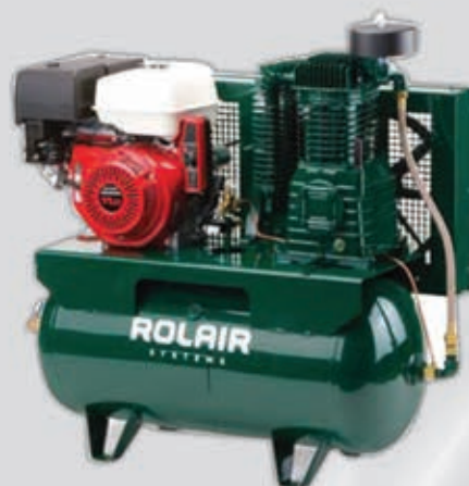
- Air compressor