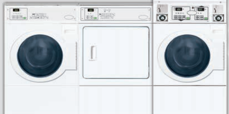
- Front Loading Washers / Dryers and Stack Washer Dryer ( Coins / non Coins )