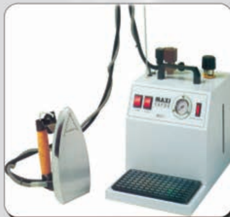
- Steam Boiler