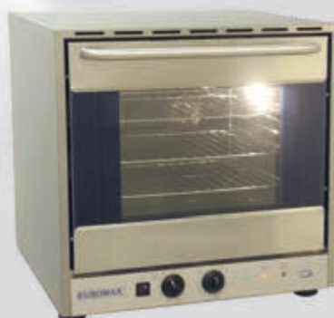
- Convection Oven