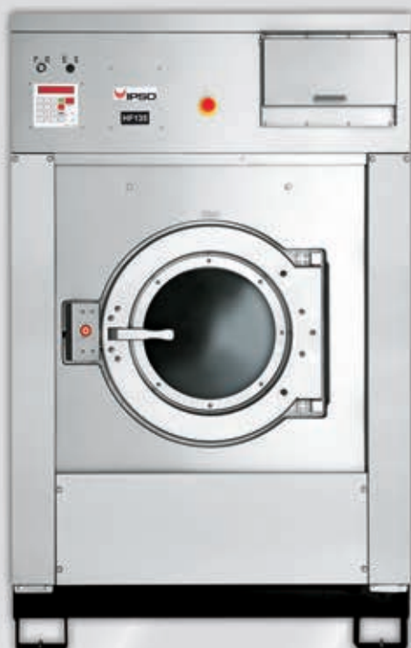
- Free standing washer extractor from 18 - 200 lb