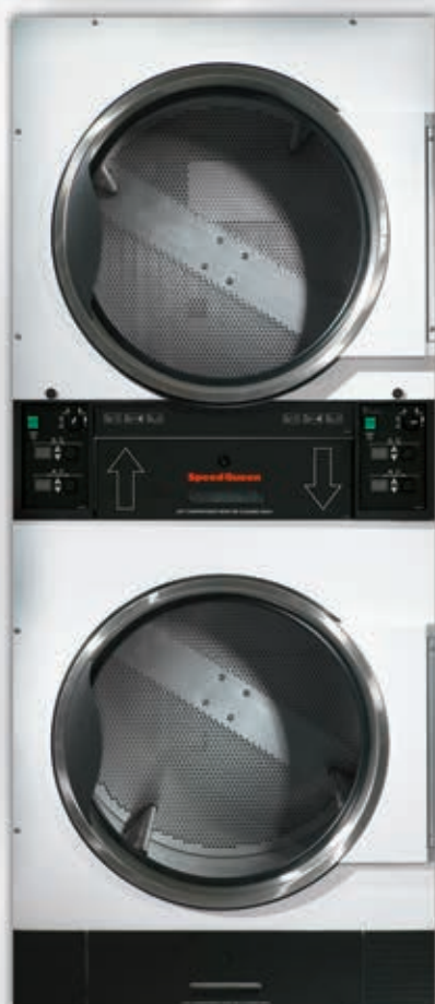
- Stack tumbler dryers from 30 - 45 lb