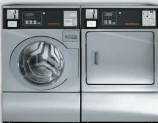
- Stainless Steel Front Loading Washers / Dryers ( Coins / non Coins )