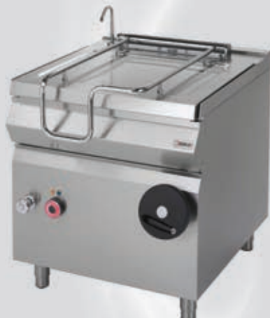
- Tilting Pan Direct&Indirect Heating