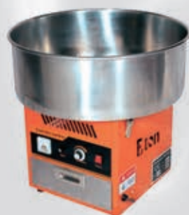
- Sugar Candy