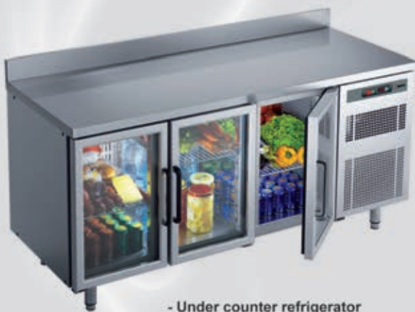
- Under counter refrigerator