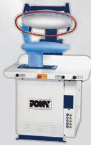
- Mushroom Press Machine