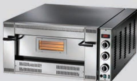
- Pizza Oven / singleDeck