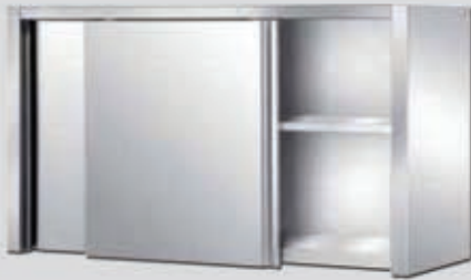
- Base Cabinet & Wall Cabinet with sliding doors