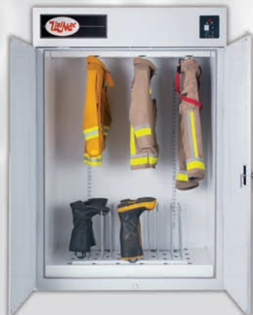
- Firemens dryer cabinet