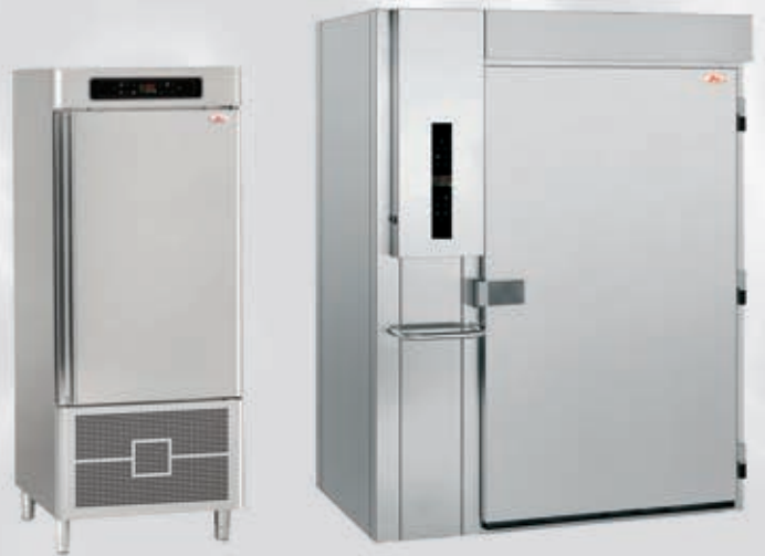
- Blast chiller & Shock freezer