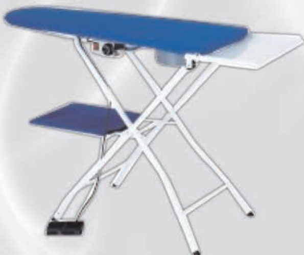
- Ironing Table