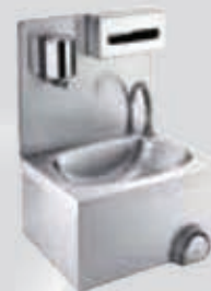
- Wall Hand Washing Sink