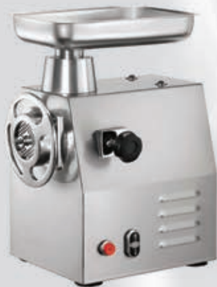
- Meat Mincer