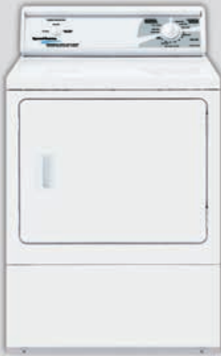
- Home Style Washer and Dryer