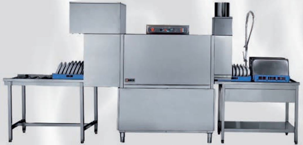
- Rack Dishwasher