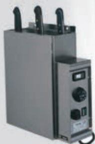
- Knife sterilizers