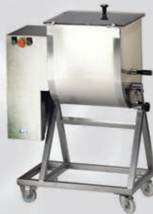
- Meat Mixer