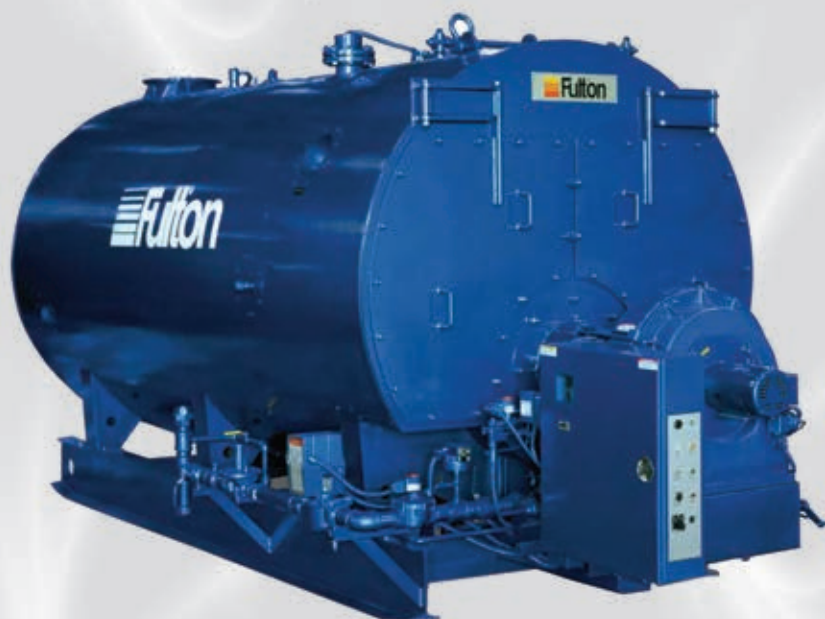
- Steam Boilers Horizontal