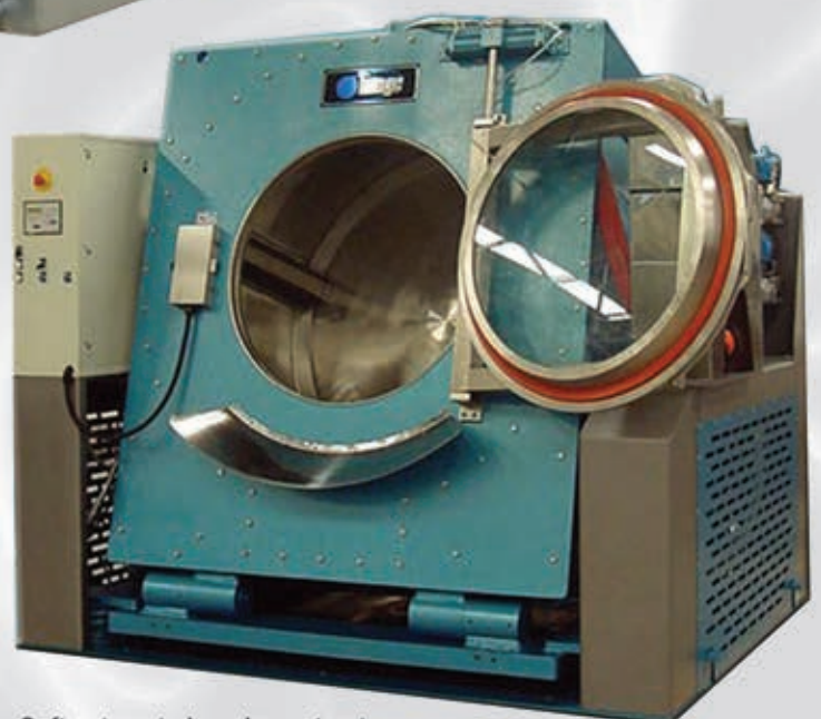
- Soft automated washer extractor from 275 - 485 lb