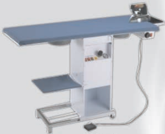
- Ironing Table