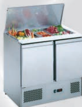
- Salad Refrigerator