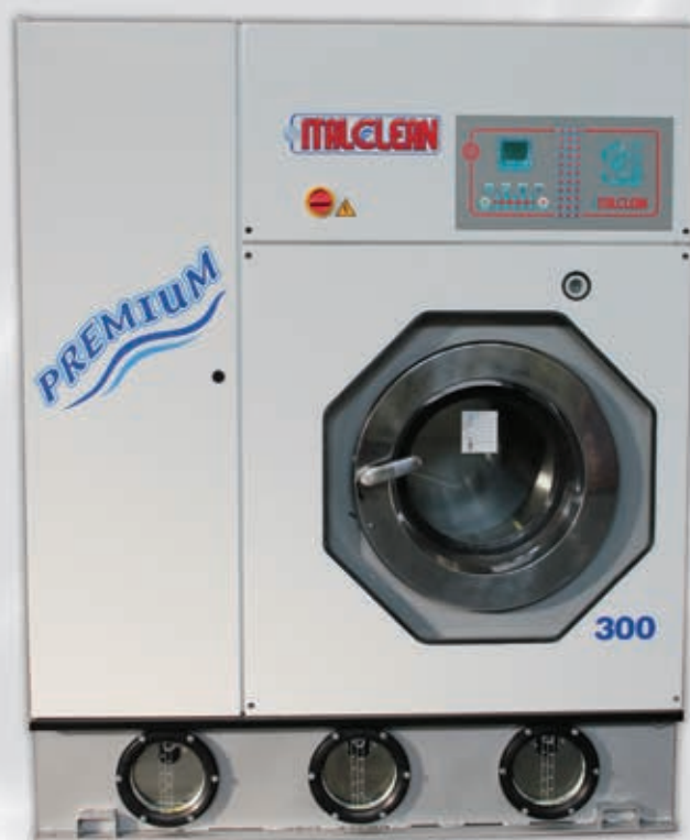
- Wide line Dry clean machine from 10 - 55 kg