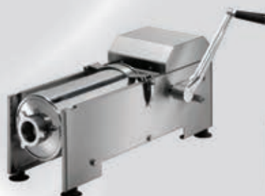
- Sausage Filler Machine