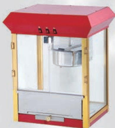
- Pop Corn