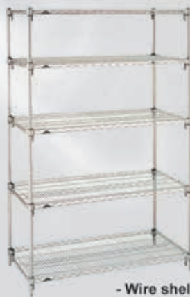
- Wire shelf