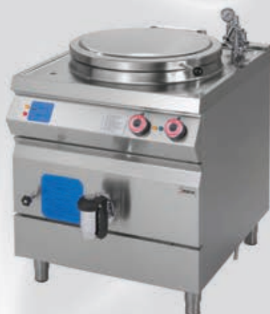
- Boiling pan / Gas & Electric