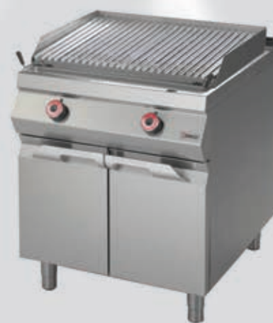
- Lava Stone Grill