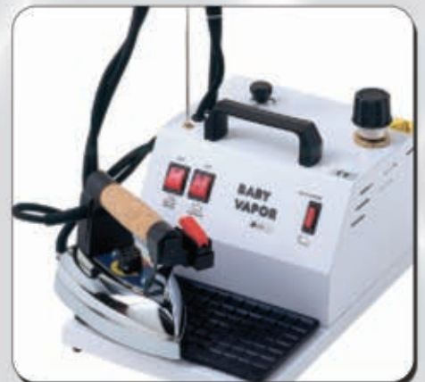
- Steam Boiler