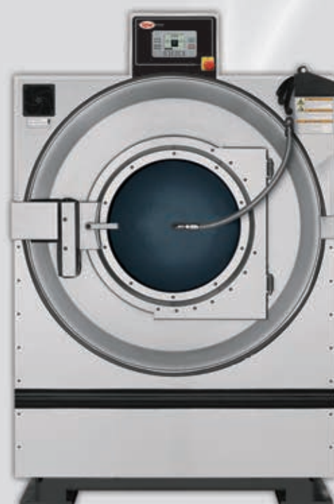
- Pocket Hard mount washer extractor from 35 - 150 lb