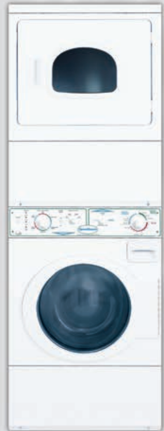
- Stack Washer and Dryer