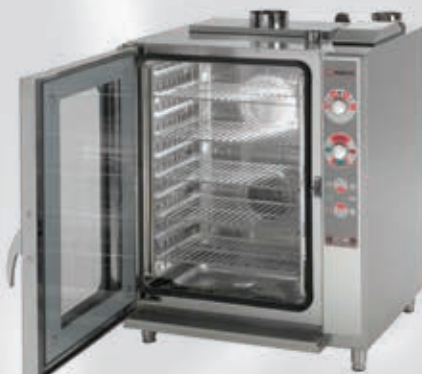
- Convection Oven