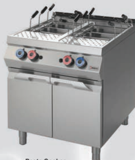
- Pasta Cooker