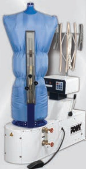
- Form finisher