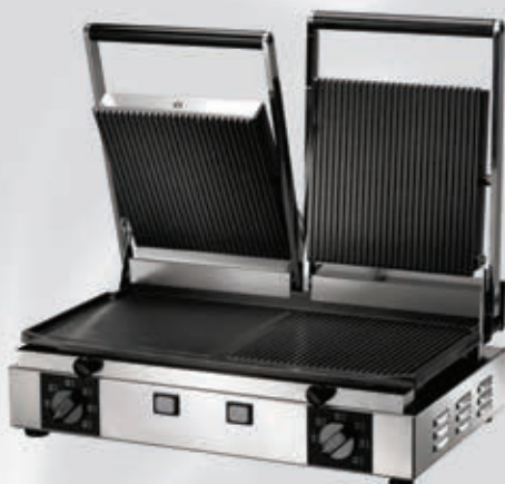
- Contact Grill