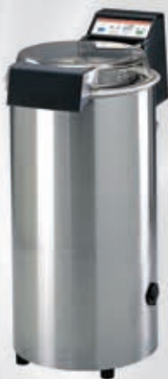
- Vegetable Washer & Dryer