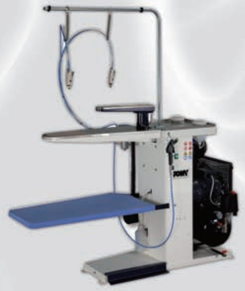
- Spotting table