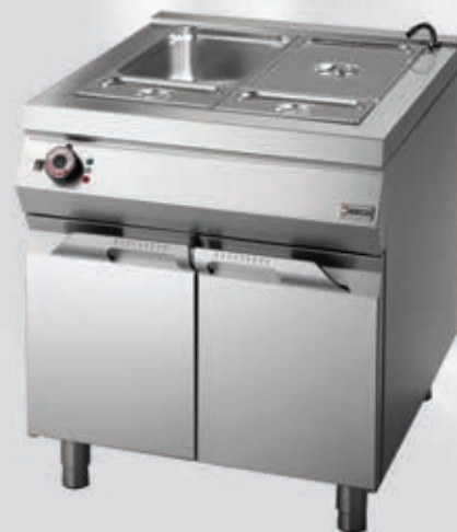
- Bain Marie Gas & Electric