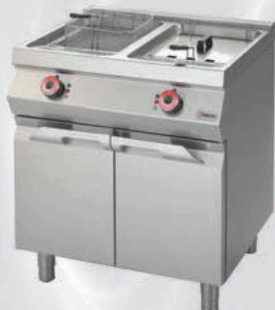
- Fryer double bowl Gas & Electric