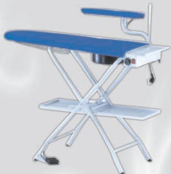
- Ironing Table