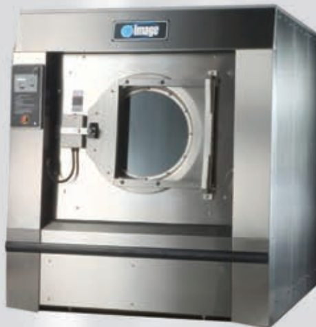
- Soft mount industrial washer extractor from 110 - 300 lb