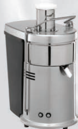
- Electric centrifugal CFV30