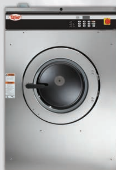
- Cabinet hard mount washer extractor From 20 - 125 lb ( Coins / non Coins )