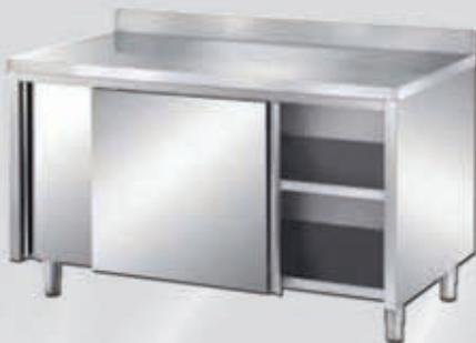
- Work Table