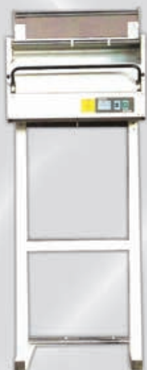
- Packaging Machine