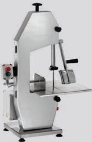
- Bone Band Saw