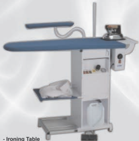
- Ironing Table