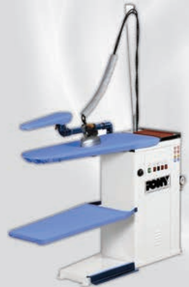
- Ironing table & boiler and Vacuum