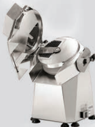
- Vegetable Cutter