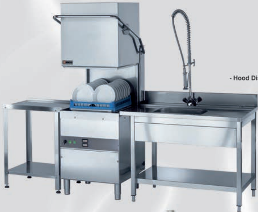
- Hood Dishwasher