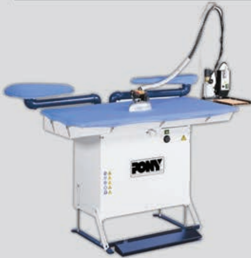
- Rectangular ironing table & boiler and Vacuum