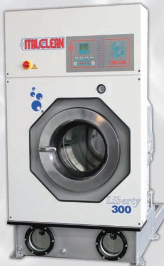
- Dry clean machine 2 tank from 10 - 18 kg