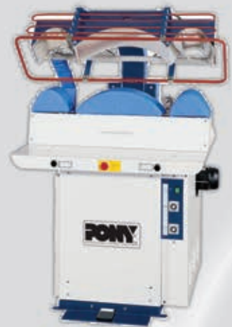
- Collar & Cuff Press Machine