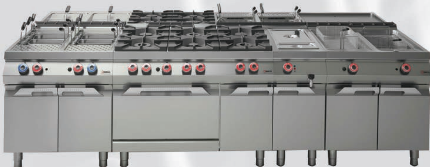
- Cooking Line