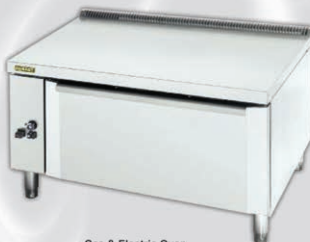
- Gas & Electric Oven