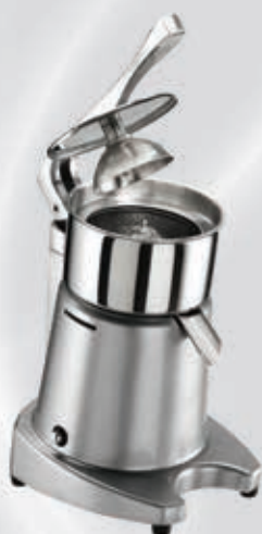
- Citrus Juicer