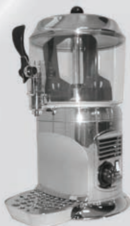
- Hot chocolate Dispenser