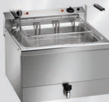
- Pasta Cooker