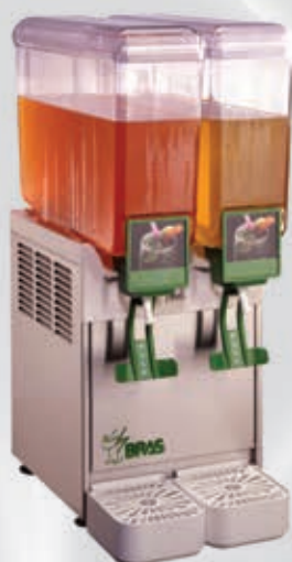
- Cold Drinks Dispenser