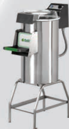
- Potato Peeler