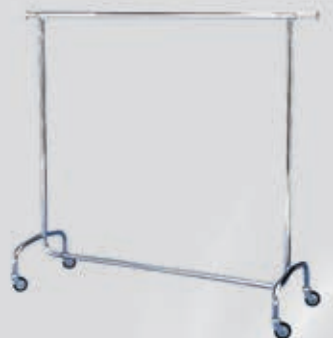
- Chromed Single & double stander