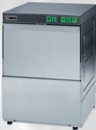
- Rack Dishwasher