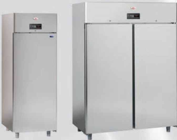
- Chillers & Freezers