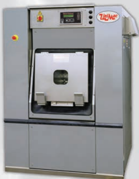
- Barrier & Medical washer extractor