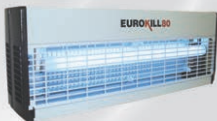
- Insect Killer