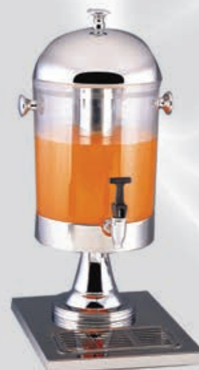
- Juice Dispenser