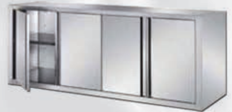
- Base Cabinet & Wall Cabinet with hinged doors