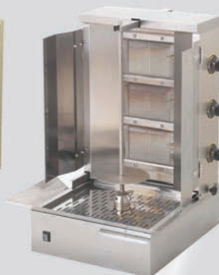
- Shawarma machine