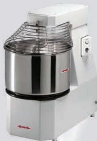
- Spiral Kneeder