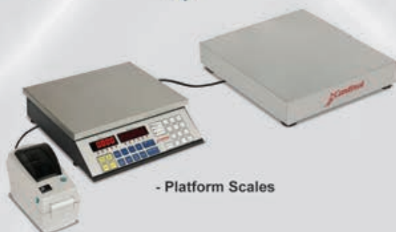
- Platform Scales