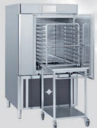
- Roll in chiller