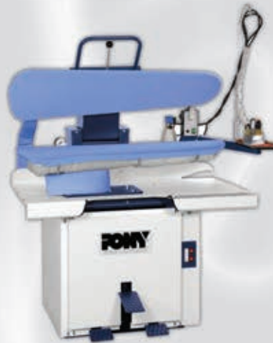
- Universal Press Machine