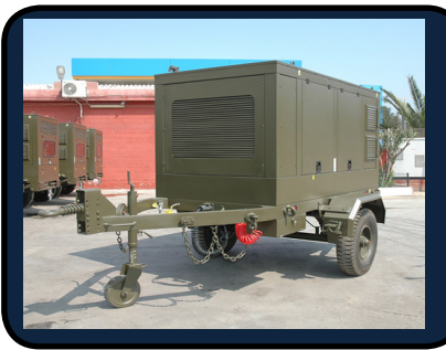
218 kva diesel generator set with road trailer