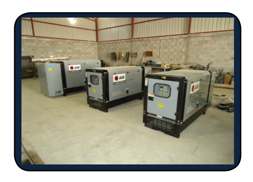
20 kva diesel generator set with super sound attenuated canopy

As a safety feature, the circuit breaker is mounted close to the control panel. All models feature heavy gauge doors on either side to allow generous access for maintenance.