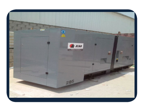
40 kva diesel generator set with sound attenuated canopy