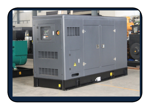
10-250 kva diesel generator set with sound attenuated canopy